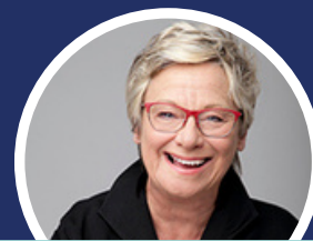
Former Legislator and Mayor DEB EDDY